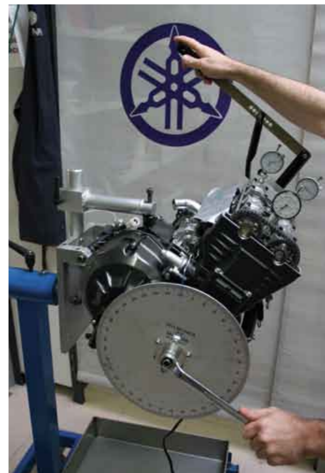
2007 YZF-R1 engine cam timing