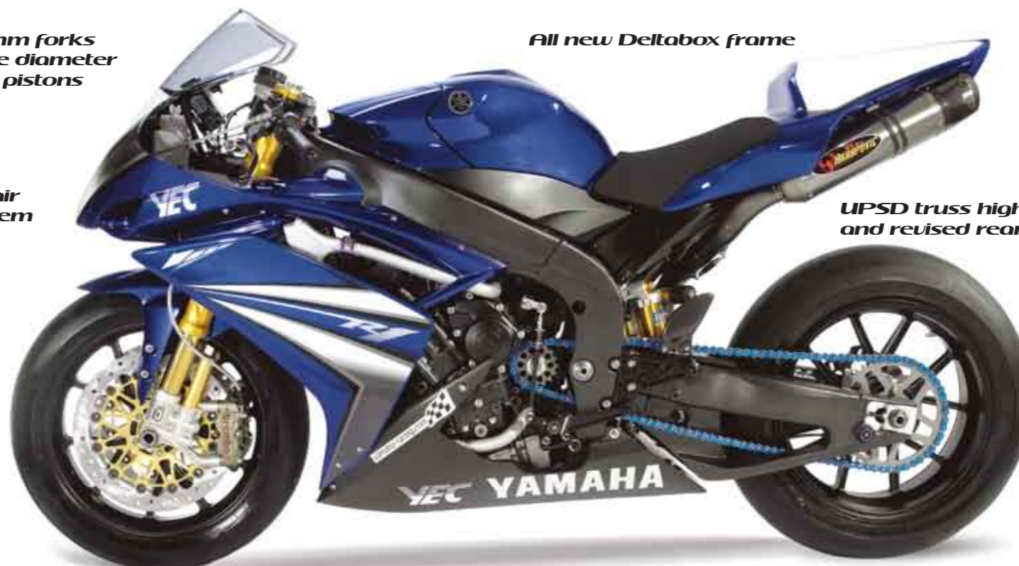
Slipper clutch fitted as standard