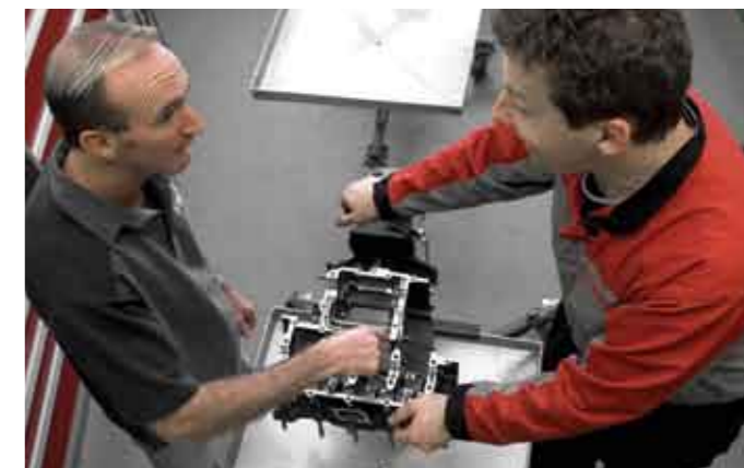
YZF-R6 parts development